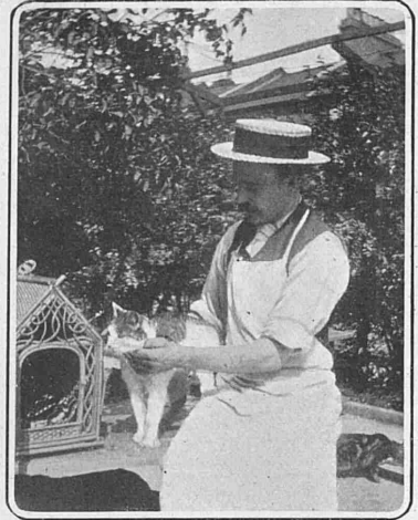
A SPECIAL BOARDER WHO HAS SIX TOES ON ONE FOOT