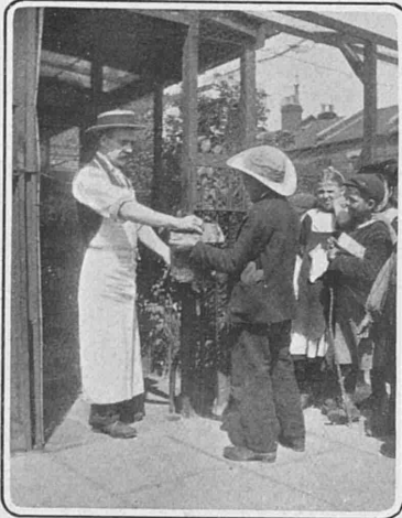
ARRIVAL OF A STRAY CAT FOR FOOD AND SHELTER